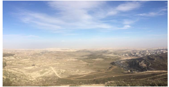
Photo from January 2017 ~ This is from my first full day in Israel during a seminary pilgrimage to the Holy Land. I was so struck by the vast expanse and its barren beauty that I audibly gasped. I cannot imagine being alone in this wilderness now let alone in the first century for forty days (or a very, very long time).